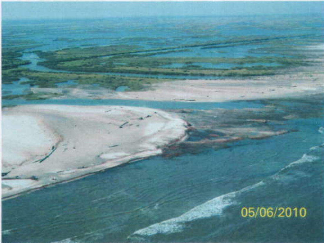
29 07 84N 90 08 50W Approximately 25 foot wide.