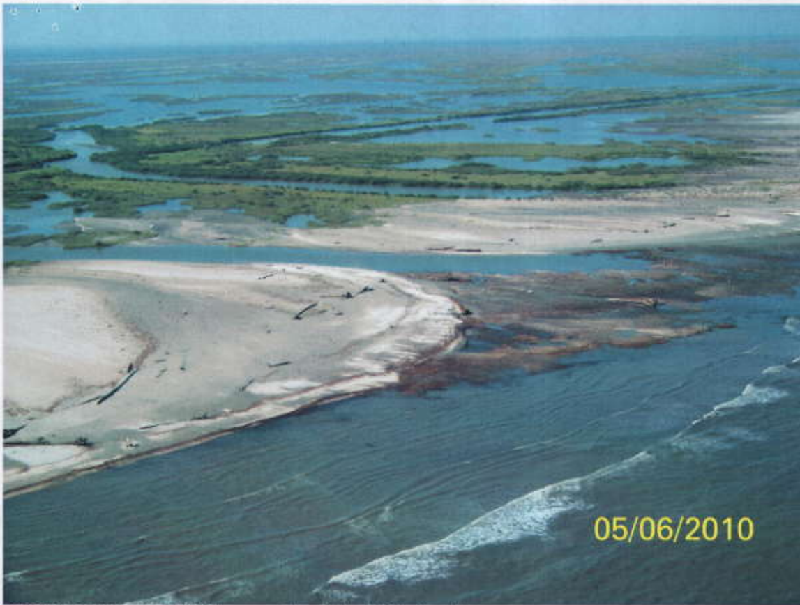
29 07 84N 90 08 50W Approximately 25 foot wide.