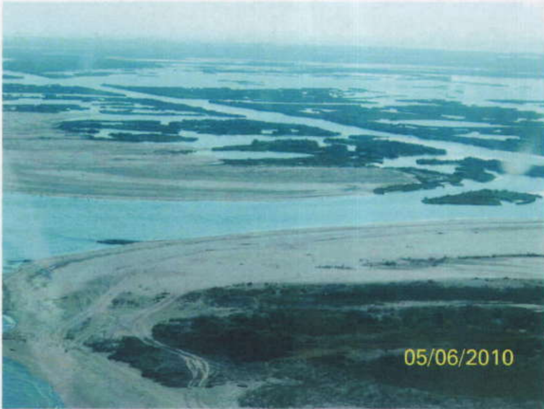
29 09 77N 90 05 50W Approximately 150 foot wide.

There is an additional possible breach located at 29 06 70N 90 10 59W that the photo did not come out. It was not a directly visible breach. This location at high tide would have water passing over it into the marsh. The width of the water passage is approximately 20 foot wide.