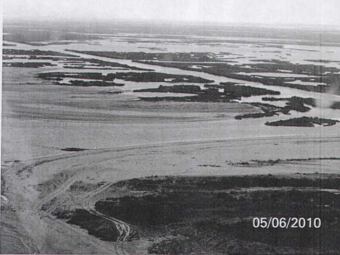
29 09 77N 90 05 50W Approximately 150 foot wide.

There is an additional possible breach located at 29 06 70N 90 10 59W that the photo did not come out. It was not a directly visible breach. This location at high tide would have water passing over it into the marsh. The width of the water passage is approximately 20 foot wide.