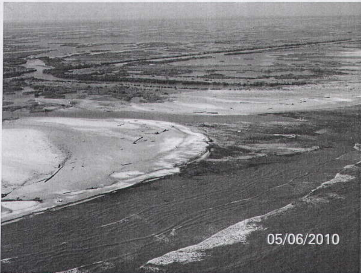
29 07 84N 90 08 50W Approximately 25 foot wide.