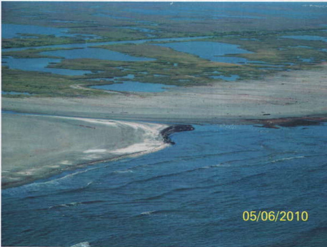
29 08 25N 90 07 88W Approximately 15 foot wide.