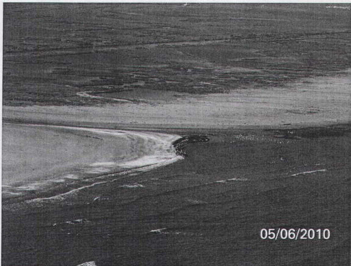
29 08 25N 90 07 88W Approximately 15 foot wide.