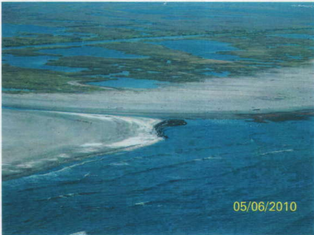
29 08 25N 90 07 88W Approximately 15 foot wide.