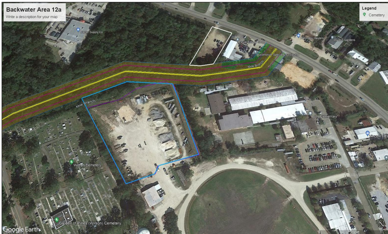
Figure I5:1-1. Location of Backwater Site to Create Stream Mud Bottom along Mile Branch

Note: The light blue line is the approximate area. The purple line represents the extent of the city owned property adjacent to Mile Branch.