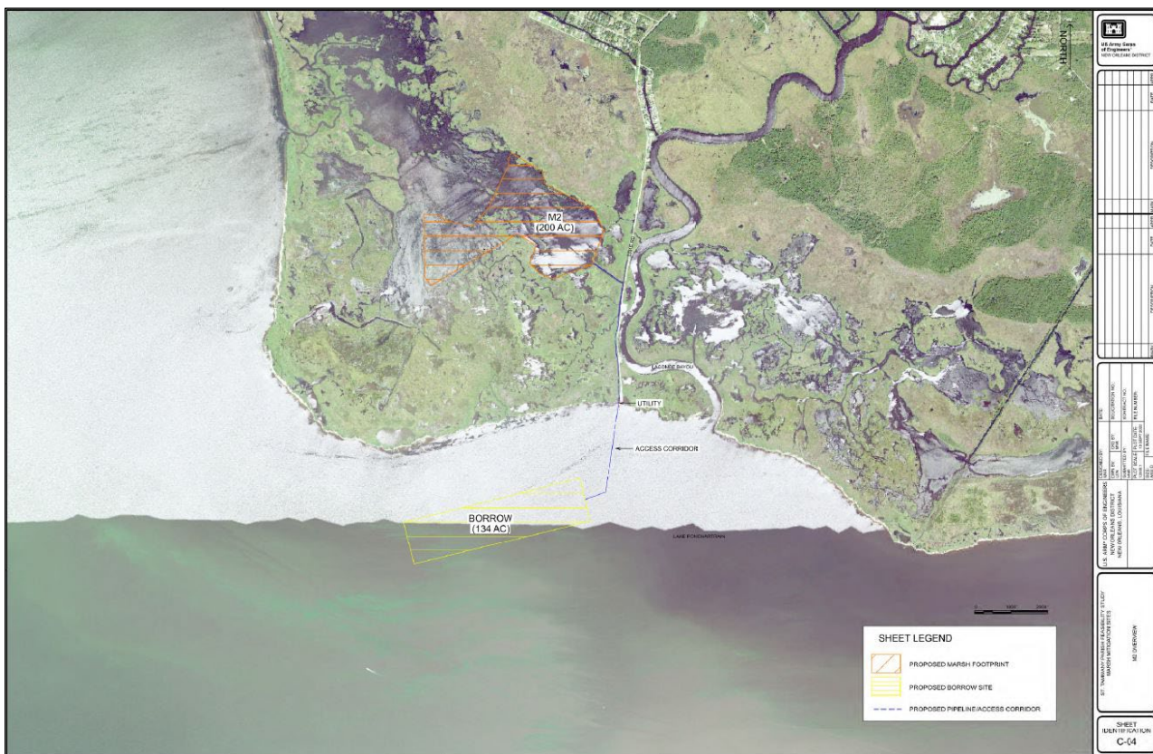
Figure I1:1-1. Project Location

The proposed marsh mitigation site (M-2) is located on the north shore of Lake Pontchartrain, east of the Causeway Bridge near Lacombe (Figures I1:1-1 and I1:1-2). The site is within the acquisition boundary of the Big Branch Marsh National Wildlife Refuge, but is currently under private ownership. The site would provide 200 acres (47 AAHUs) of fresh and intermediate marsh habitat to compensate for unavoidable wetland impacts from the construction of the South and West Slidell levee and floodwall system under the St. Tammany Parish, Louisiana Feasibility study. Estimated footprint is 200 acres with a dike perimeter of 16,067 feet. During PED, an open water site visit is recommended to conduct WVA evaluation, collect preliminary site data, and visually observe site conditions.