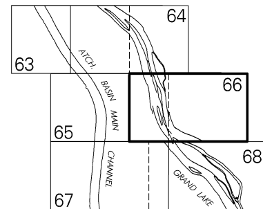
INDEX TO ADJOINING SHEETS

IN 137 SHEETS U.S. ARMY ENGINEER DISTRICT, NEW ORLEANS, CORPS OF ENGINEERS