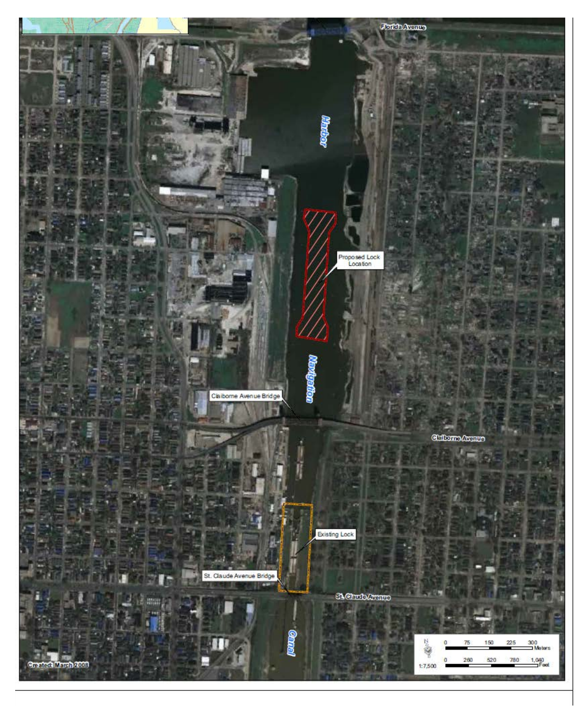
Figure 2 below shows location of existing (yellow) and proposed (red) locks within the IHNC.