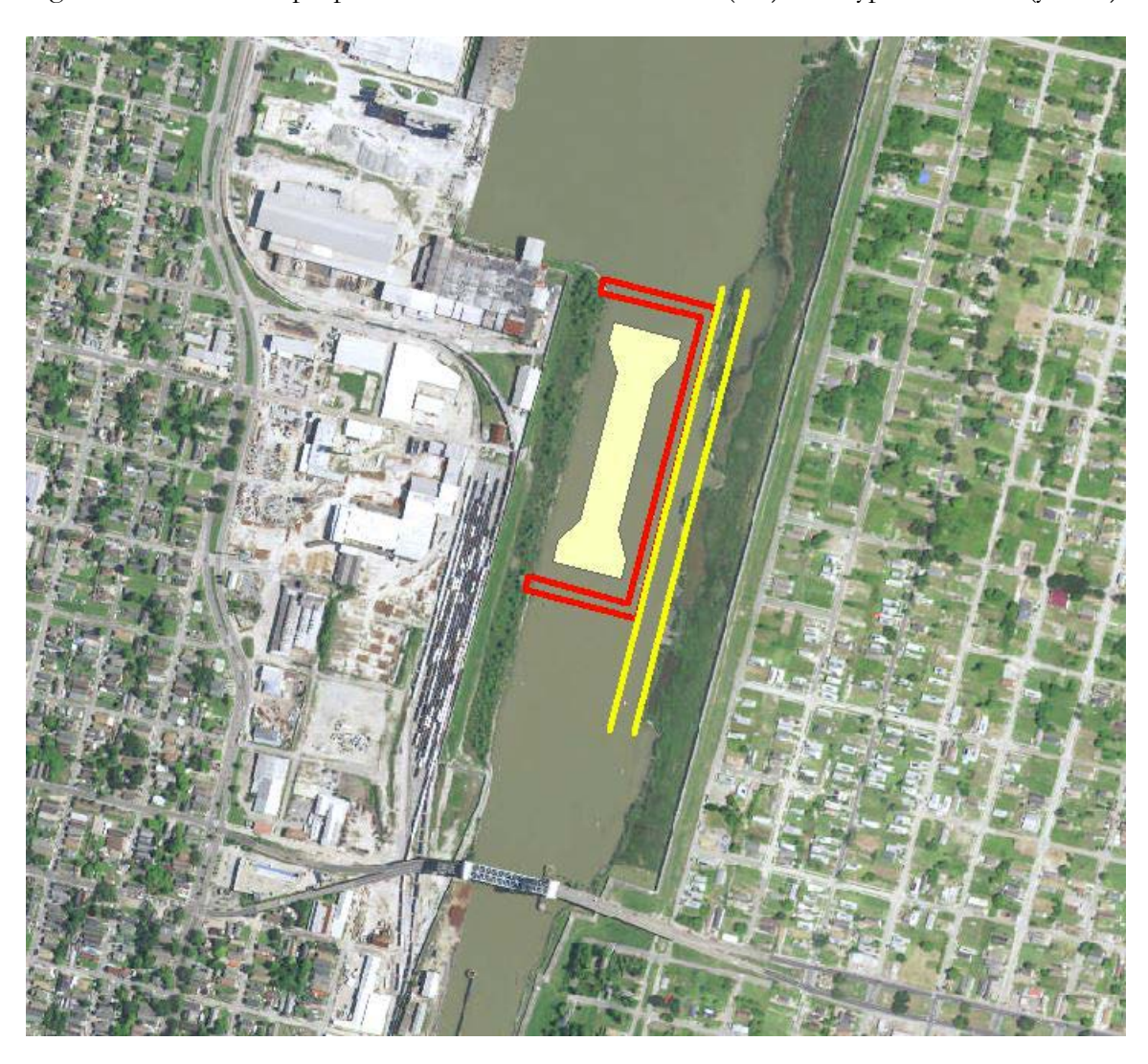
Figure 3 below shows proposed lock location - cofferdam (red) and bypass channel (yellow).