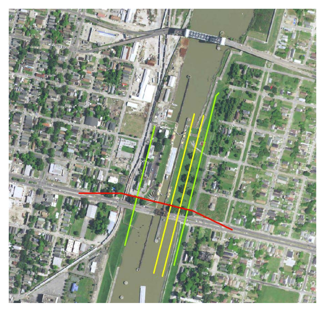
Figure 4 below shows existing lock location – temporary bridge (red), new flood risk reduction measures (green) and bypass channel (yellow).