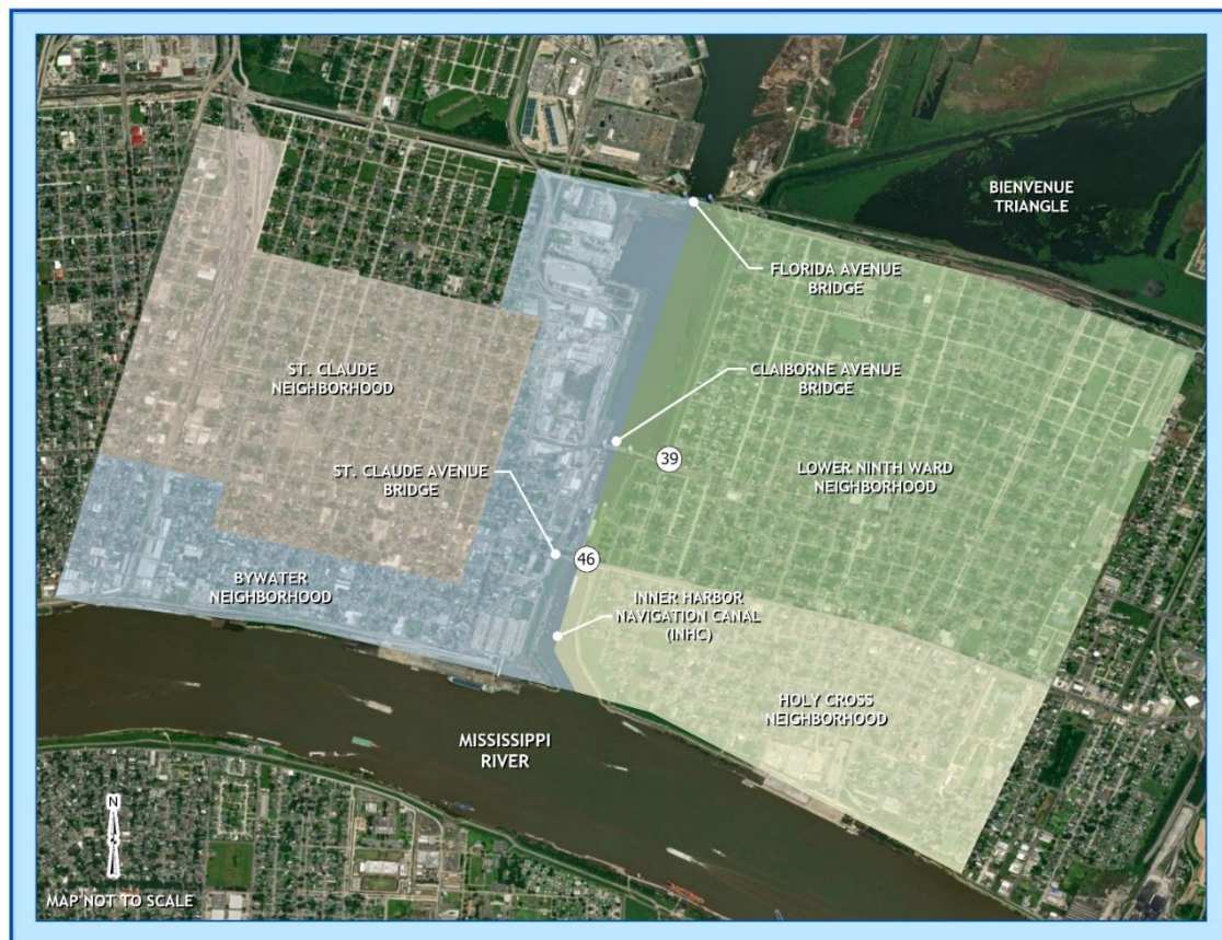
Figure 2-1 Primary Neighborhoods within the IHNC Project Area.

The Bywater and Holy Cross neighborhoods run along the Mississippi River and lie west and east, respectively, of the IHNC and south of St. Claude Avenue. The St. Claude and Lower Ninth Ward neighborhoods are north of St. Claude Avenue and extend north to Florida Avenue and lie west and east respectively of the IHNC. The eastern boundary of the Lower Ninth Ward and Holy Cross neighborhoods is the Orleans and St. Bernard Parish line. The western boundary of the Bywater and St. Claude neighborhoods is the Franklin-Almonaster corridor. Figure 2-1 shows the neighborhoods relative to the IHNC.