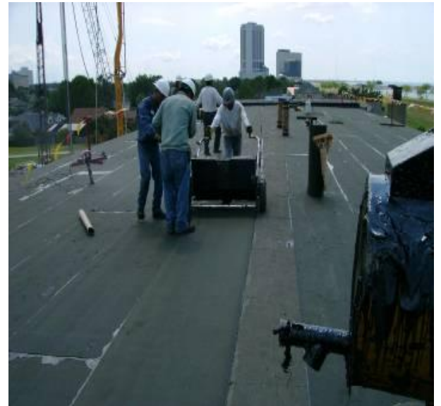
Roof repairs at Bonnabel Pump Station in Jefferson Parish

U.S. ARMY CORPS OF ENGINEERS – TEAM NEW ORLEANS 7400 Leake Avenue, New Orleans, LA 70118 | www.mvn.usace.army.mil Visit the following links to follow us on Facebook, Twitter and Flickr: www.facebook.com/usacenola www.twitter.com/teamneworleans www.flickr.com/teamneworleans