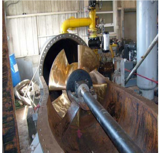
Rebuilding of the horizontal pump at Scarsdale Pump Station in Plaquemines Parish