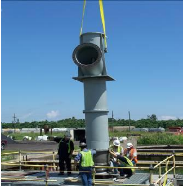
Installation of vertical pump at Elaine Street Pump Station in Orleans Parish

St. Mary's Pump Station in St. Bernard Parish was the last pump station to be repaired by the Corps, and that work was completed in March 2011.