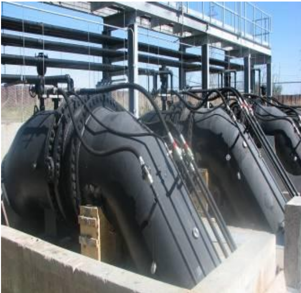
Refurbished pumps at Guichard Pump Station in St. Bernard Parish