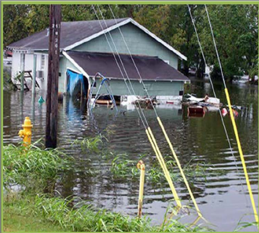
Hurricane Ike flooding in Delcambre, Louisiana.