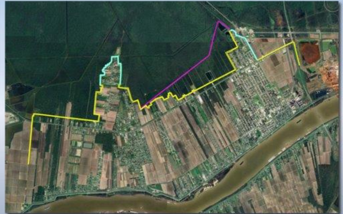
Fig 1 - Features common to Authorized Project & St. James Connector Levee