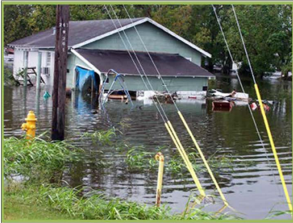
Hurricane Ike flooding in Delcambre, Louisiana.