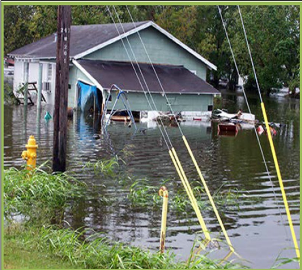
Hurricane Ike flooding in Delcambre, Louisiana.

Appendix A-6 – Fish and Wildlife Coordination Act Compliance