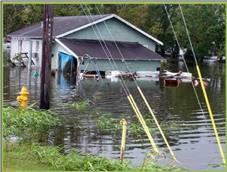
Hurricane Ike flooding in Delcambre, Louisiana 2008.