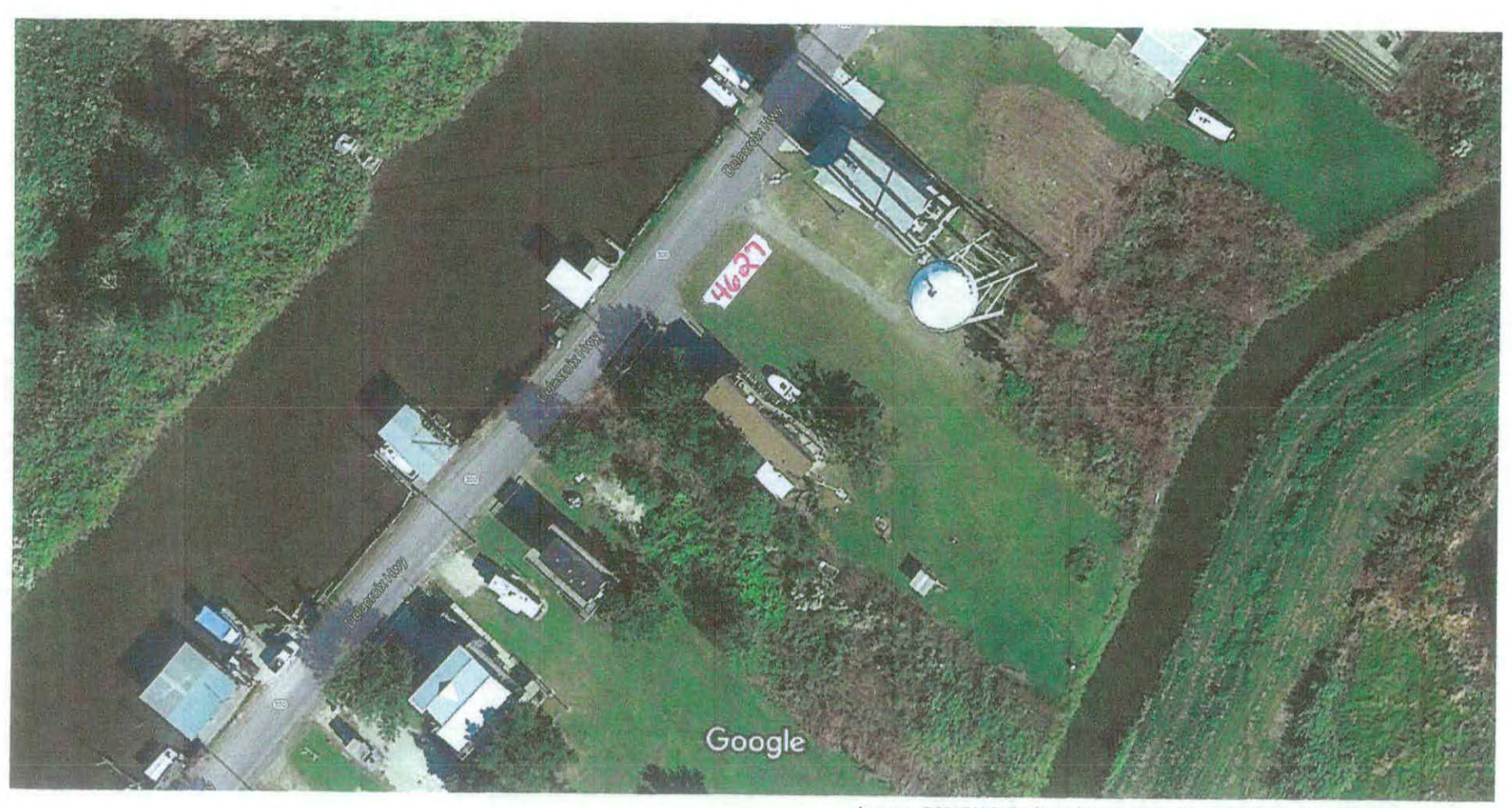
20 ff