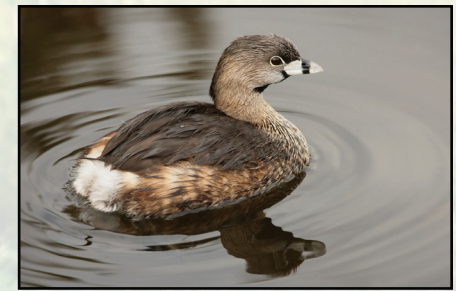
Pied-billed Grebe (Podilymbus podiceps)