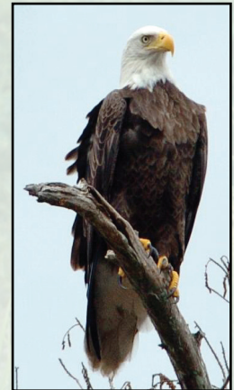
Bald Eagle (Haliaeetus leucocephalus)