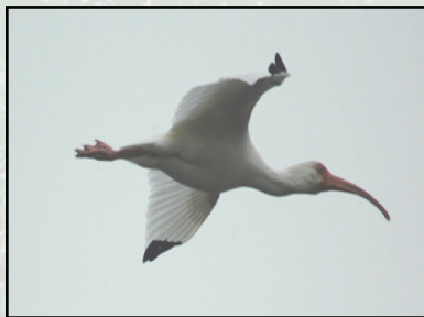
White Ibis (Eudocimus albus)