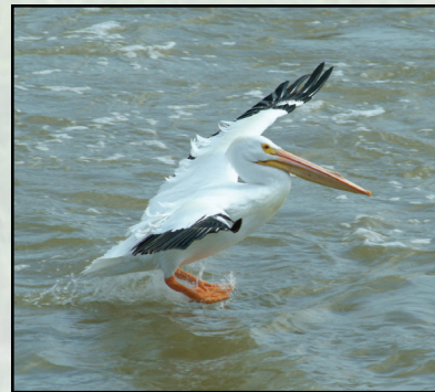
American White Pelican (Pelecanus erythrorhynchos)