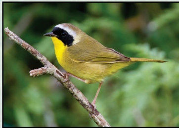
Common Yellowthroat (Geothlypis trichas)

The Bonnet Carré Spillway has been a top choice among birders for many years. Because of the wide array of habitats (swamps, ponds, sand spits, fields, forest, and marsh) many species of birds call it home!