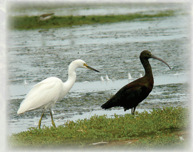
Snowy Egret and Glossy Ibis ( Egretta thula and Plegadis falcinellus )