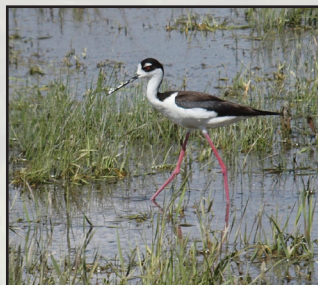
Black-necked Stilt ( Himantopus mexicanus )

In this Brochure there were 16 birds that are common to the Bonnet Carré Spillway. How many were you able to identify?