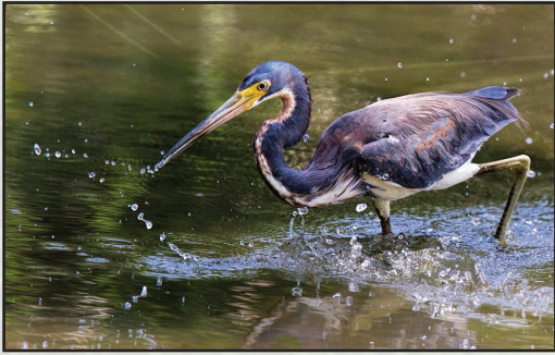
Tricolored Heron ( Egretta tricolor )