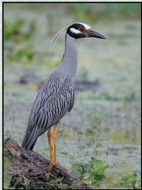
Yellow-Crowned Night Heron (Nyctanassa violacea)