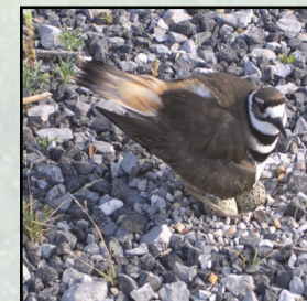
Killdeer (Charadrius vociferus)