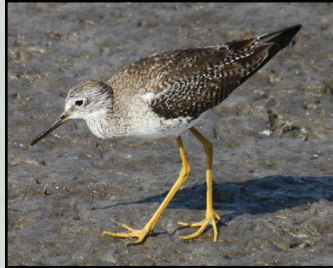
Lesser yellowlegs (Tringa flavipes)