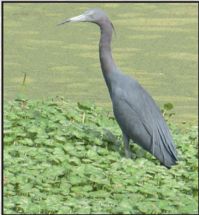
Little Blue Heron ( Egretta caerulea )