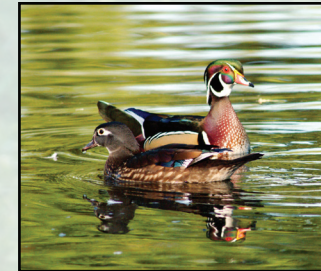
Wood Duck, female & male (Aix sponsa)