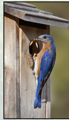
Eastern Blue Bird (Sialia sialis)