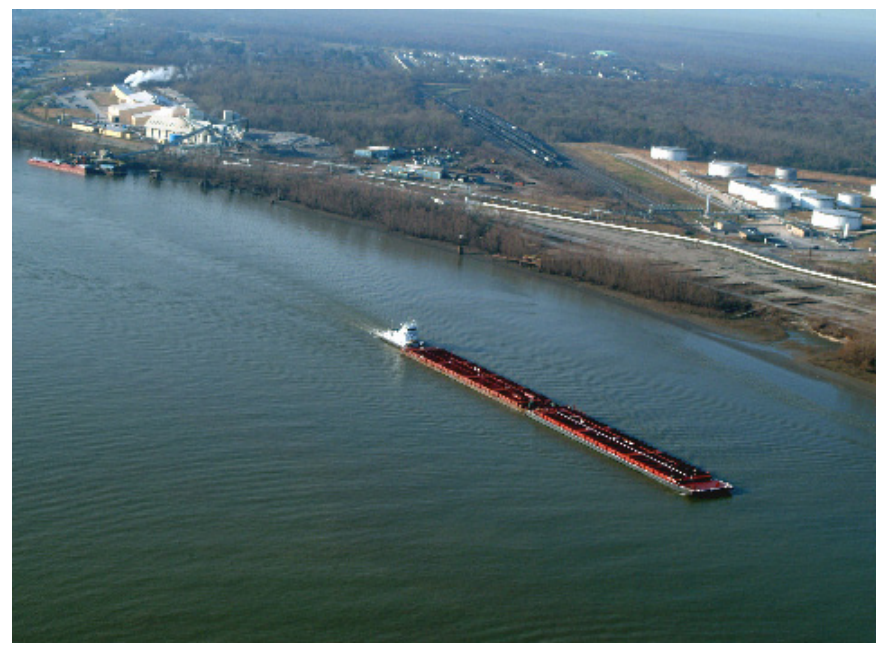
Navigation and Industry along the Mississippi River above New Orleans.

The Atchafalaya Basin could not accept the Mississippi flow without massive flooding, extensive relocations, and the upheaval of the social and economic patterns of that area. A new route would render hundreds of millions of dollars worth of flood control projects useless along the lower Mississippi and expensive flood control projects would be required in the newly created Mississippi delta.