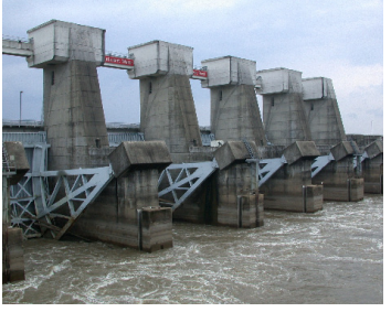
The Auxiliary Structure works together with the Low Sill Structure to maintain a 70-30 flow distribution between the Mississippi and Atchafalaya rivers, respectively.

Realizing that repairs and modifications to the two structures were not enough, New Orleans District recommended an auxiliary structure with a new inflow channel be constructed. The Chief of Engineers approved, and construction started in July 1981. The Auxiliary Control Structure was completed in December 1986 at a total cost of $206 million.