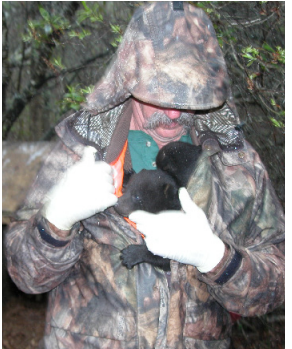
Black bear eintroduction of mother and cubs.

The Louisiana black bear (Ursus americanus luteolus) is one of 16 recognized subspecies of the American black bear. The Louisiana black bear is distinguished from other black bears by a longer and narrower skull and larger molar teeth. Weights can range from 200 pounds for females to 400 pounds for males. Black bears prefer bottomland hardwood forests where they overwinter in large hollow cypress trees. Since its listing as a threatened species in 1992, the Louisiana black bear has been found in two viable