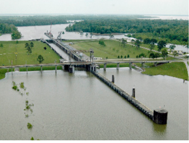
Old River Lock Structure

mercial traffic between the Mississippi and the Red and Atchafalaya rivers. The majority of the traffic is petroleum, chemicals, agriculture, and aggregate products. Approximately 15 tows travel through the lock each day.