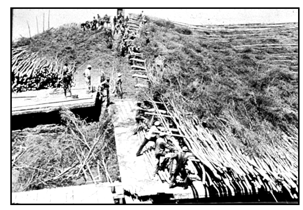
Laborers construct willow "mattresses."

Today, Southwest Pass is used by oceangoing vessels bound for the ports between New Orleans and Baton Rouge. The U.S. Army Corps of Engineers maintains the channel to a 45-foot depth.