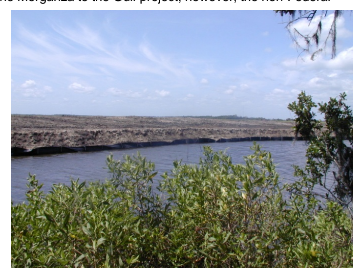
Levee Reach J-1 Construction

Bayou Petit Interim Barge Gate, under construction